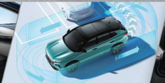
540° VEHICLE VIEW