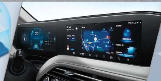
12.3" HD CONTROL SCREEN