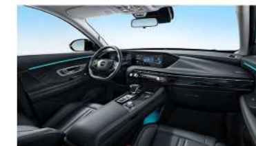
Vast Ocean Star